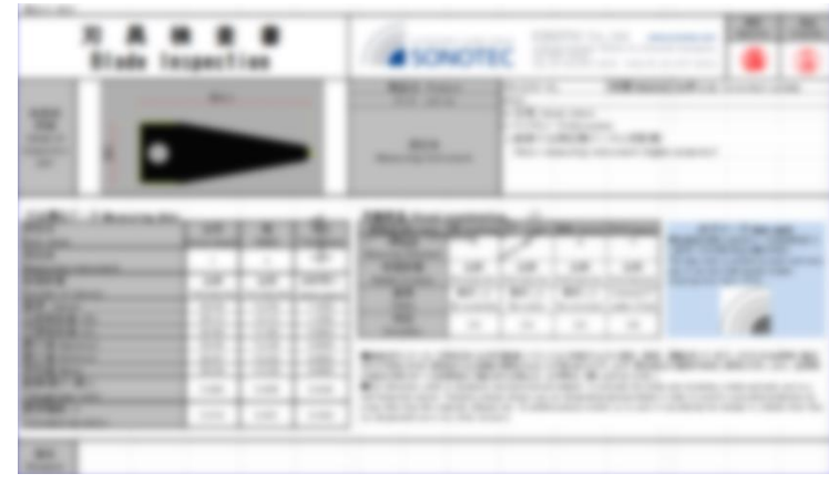
Fig.1 Blade inspection report (Image)

* Please note that the above characteristics are just examples and do not provide information that can identify all inferior products (counterfeits).